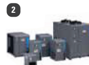
Atlas Copco FX Refrigerated Air Dryers