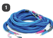
Graco Powerlock Heated Hose