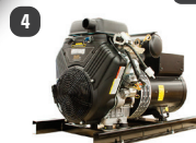
18 or 22 KW Generator