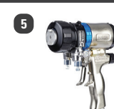
Fusion PC Gun