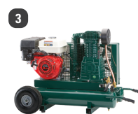
9 HP Compressor